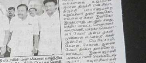
திருச்சியில் துணை முதல்-அமைச்சர் உதயநிதி ஸ்டாலின் மக்களிடம் பேசும் போது.