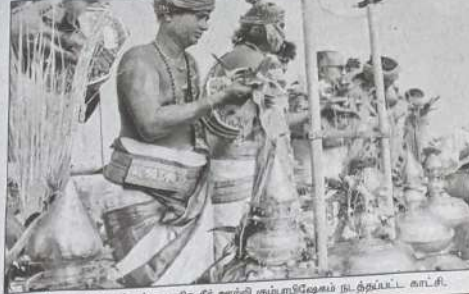
கோவிலி எழுப்பும்போது பணிகளை நிறைவேற்றும் குழுவின் உறுப்பினர்கள்.